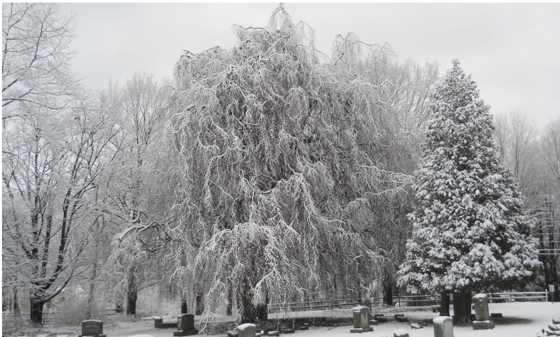
Our Copper Beach Tree Decked Out In Snow